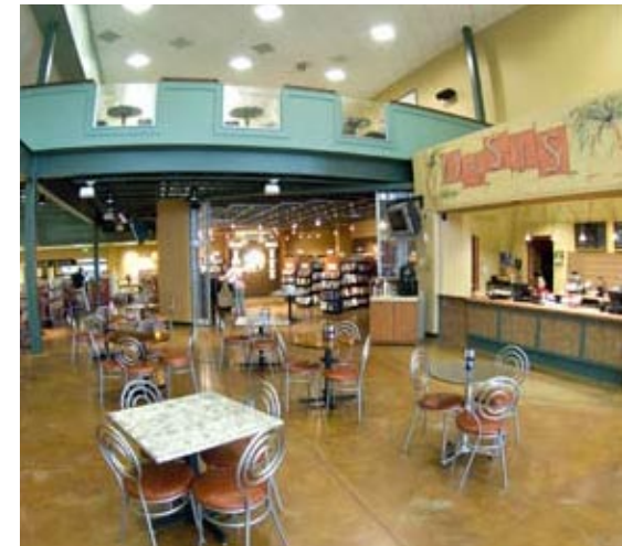
A well equipped café at Seacoast Church.

First it looked to Columbia, where in 2002 it partnered with an existing church. Then it opened a new campus in an Irmo movie theater. Then it opened a campus in Savannah, then Sum-