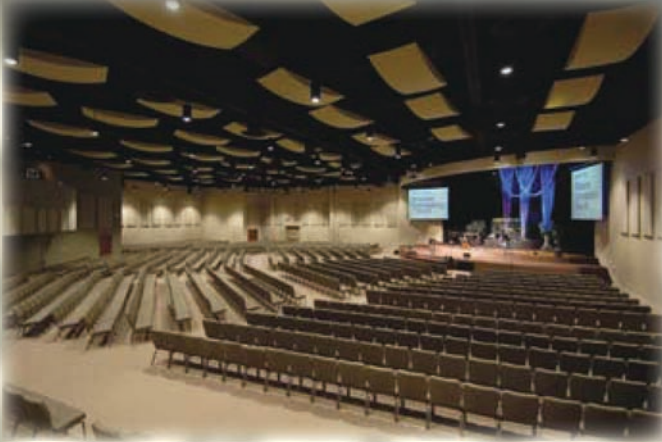
Warsaw Community Church - Warsaw, IN